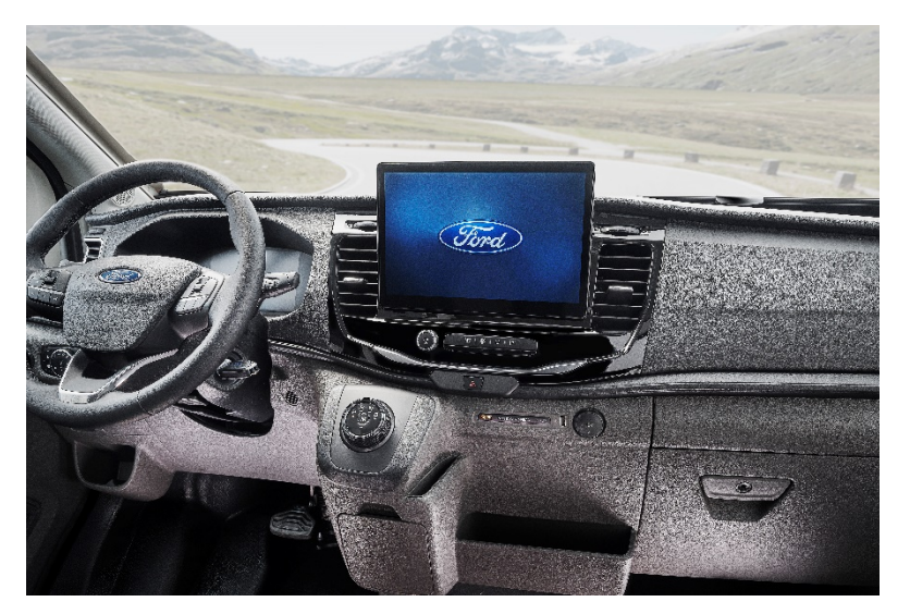
Caption: Both models impress with modern equipment in Ford quality.