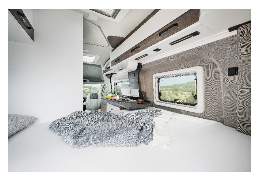
Caption: The VANTourer Ford becomes a home on four wheels with its comfortable lounge area.